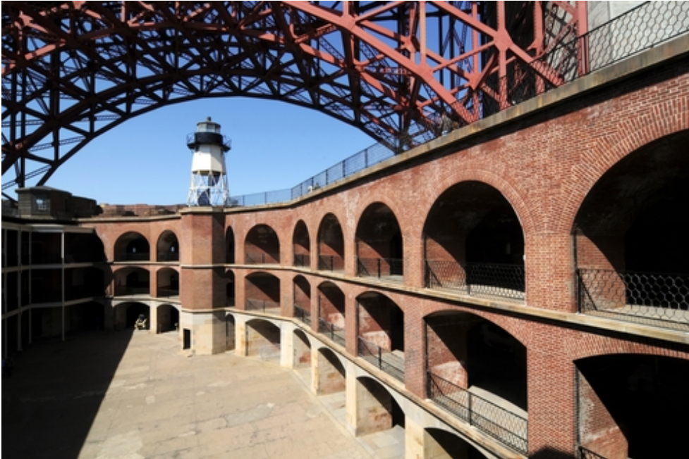
Figure 7. Fort Point and Golden Gate Bridge

During Phase 1 remediation, cast-in-drilled-hole (CIDH) piling and pile caps were added around the perimeter of the original bridge foundation pedestals. The interface of new concrete to existing concrete was strengthened with post-tensioning of monostrands, clamping the new footings to the pedestals of the existing foundations. The existing grade beams between the foundation pedestals were also substantially strengthened, and additional grade beams were constructed. After the existing towers supporting the bridge were removed, the second stage of the foundation retrofit proceeded. First, the remaining upper portions of the existing pedestals were demolished. Then, new upper pedestals were constructed and closure pours placed to incorporate these elements into the entire foundation system. The erection of a new tower followed.