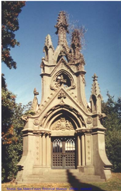
Figure 4. Cypress Lawn Cemetery de la Montaña Mausoleum

Figure 4 shows the de la Montaña Mausoleum. The mausoleum was constructed in 1907. The lower part of the structure is steel framed with sandstone cladding, while the upper part is a stone finial that sits on four stone arches atop four large granite blocks. At the time of BART subway construction, the de la Montaña Mausoleum was in a deteriorated condition due to lack of maintenance.