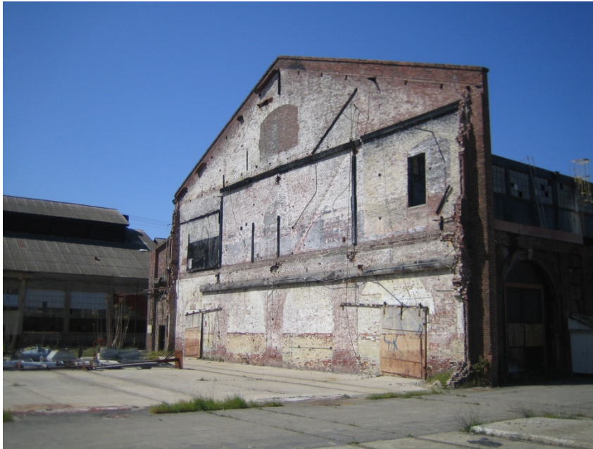
Figure 2. Car Shop within the Sacramento Railyards Central Shops Historic District

During the project’s design phase, the owner engaged a structural engineer to evaluate the condition of the buildings and the effect of future train vibration. The engineer concluded from a visual review that even though the maximum predicted vibration exceeded the FTA criterion, the vibration was not expected to cause any risk to the existing masonry walls (structural or cosmetic), with the exception of one building (Car Shop), which had a large cantilevered wall (i.e., unsupported laterally). Figure 2 shows the outside of the Car Shop’s unsupported wall.