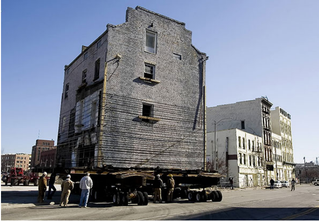
Figure 5. Gipfel Brewery building being moved