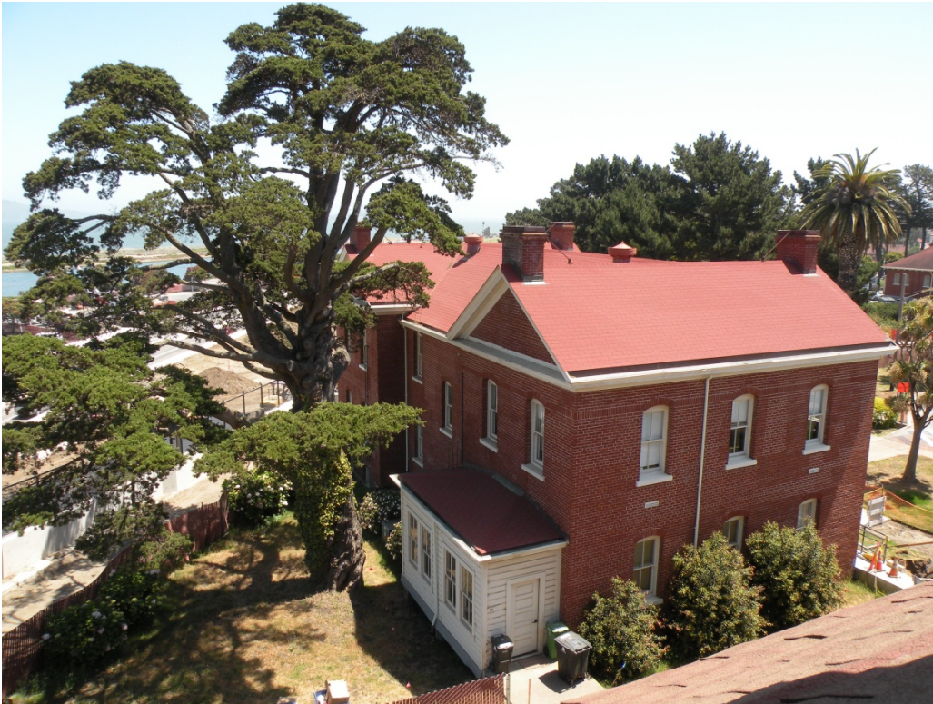
Figure 8. Buildings at the Presidio

“[A] ground vibration PPV of 2 mm/sec (0.08 inches/sec) would be a conservative, but appropriate limit for the historical buildings that are more susceptible to damage, including those in a poor structural condition and those of masonry construction. The buildings in the Main Post area of the Presidio are mostly of masonry construction and would therefore fall into this category. In addition, visual observation of the buildings under consideration in this study indicates some existing differential settlement and cracks in the facades of the brick buildings. However, most of the other historical buildings in the Presidio are wood-framed structures which are substantially less susceptible to damage from vibration. For most of these buildings, a higher PPV of 5 mm/sec (0.2 inches/sec) would be an appropriate, conservative limit for construction vibration. The exterior facades of some of these wood-framed buildings (such as the Mason Street warehouses) are in a poor condition, although it is understood that these buildings are structurally sound.”