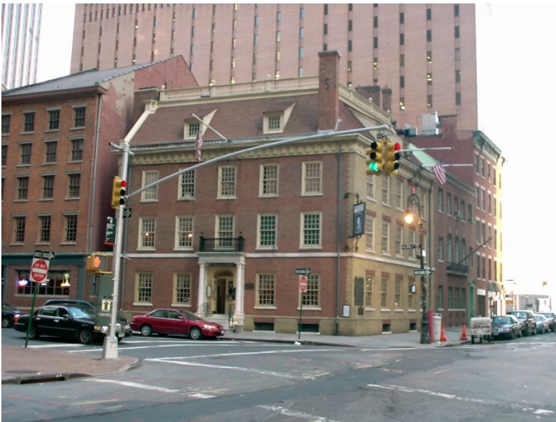
Figure 6. Fraunces Tavern.

The potentially affected buildings in the historic district were constructed between 1820 and 1970 on fill placed in the area during the 17 th Century. The historic buildings included 16 three and six story buildings located on one city block. The engineers indicated in their investigation that some of the buildings had undergone extensive renovations. Figure 6 shows Fraunces Tavern, one of several historic buildings within the Fraunces Historic District.