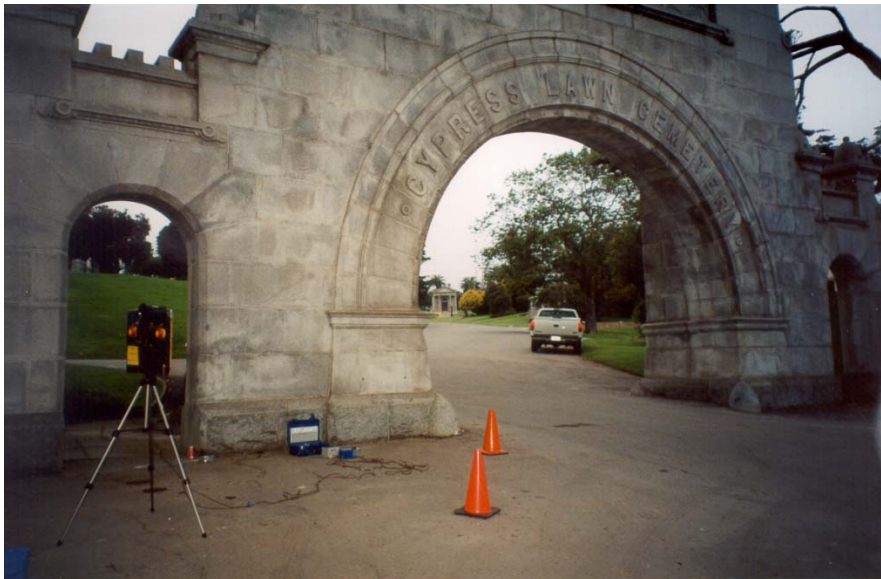
Figure 3. Cypress Lawn Cemetery Grand Gateway

Figure 3 shows the archway and a seismograph used for monitoring vibration. In addition to the seismograph at the base of the archway, there was an alarm system with warning lights (yellow for caution and red for exceedance) and an audible alarm. The warning system provided a direct feedback to the equipment operators when vibration limits were being approached or exceeded and allowed equipment operators to adjust their activity. After an initial learning stage of trial and error, the system became a reasonably successful tool to control vibration.